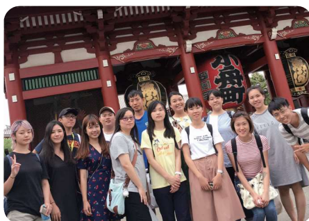
Summer Short-term Course