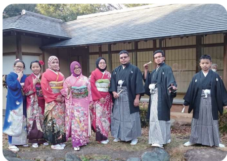
Japanese Cultural Experience